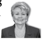
312 S. Old Dixie Hwy. Suite 201 Jupiter, FL 33458