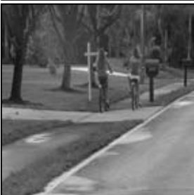
Residents enjoying new sidewalks on 155 th Place N.