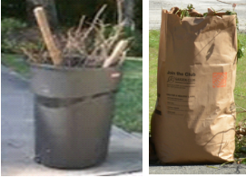
50 Gallon Can = aprox. 1/4 cubic yard