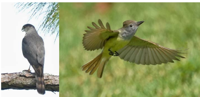
Photos of PBCE Cooper's Hawk, Great Crested Flycatcher, & Red-Shouldered Hawk