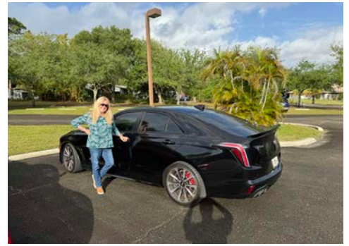
Kathy Baxter Marvel 2024 20th Anniversary Edition CT4 Blackwing